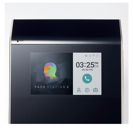
Face Recognition Access Terminal