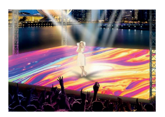
Smart LED Display