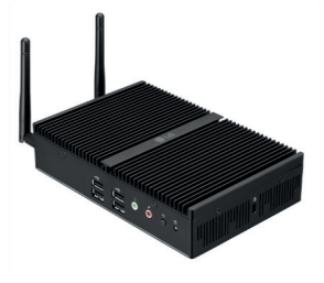
Thin Client Box