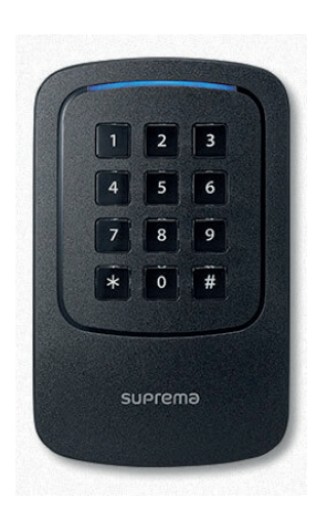
Finger & Card Access Terminal