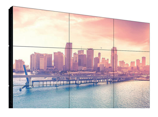
Video Wall Display