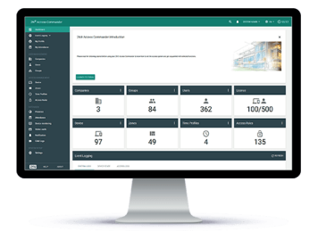
2N® ACCESS COMMANDER