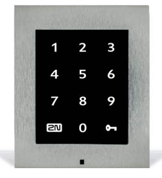
2N® ACCESS UNIT TOUCH KEYPAD