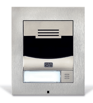
2N® IP SOLO